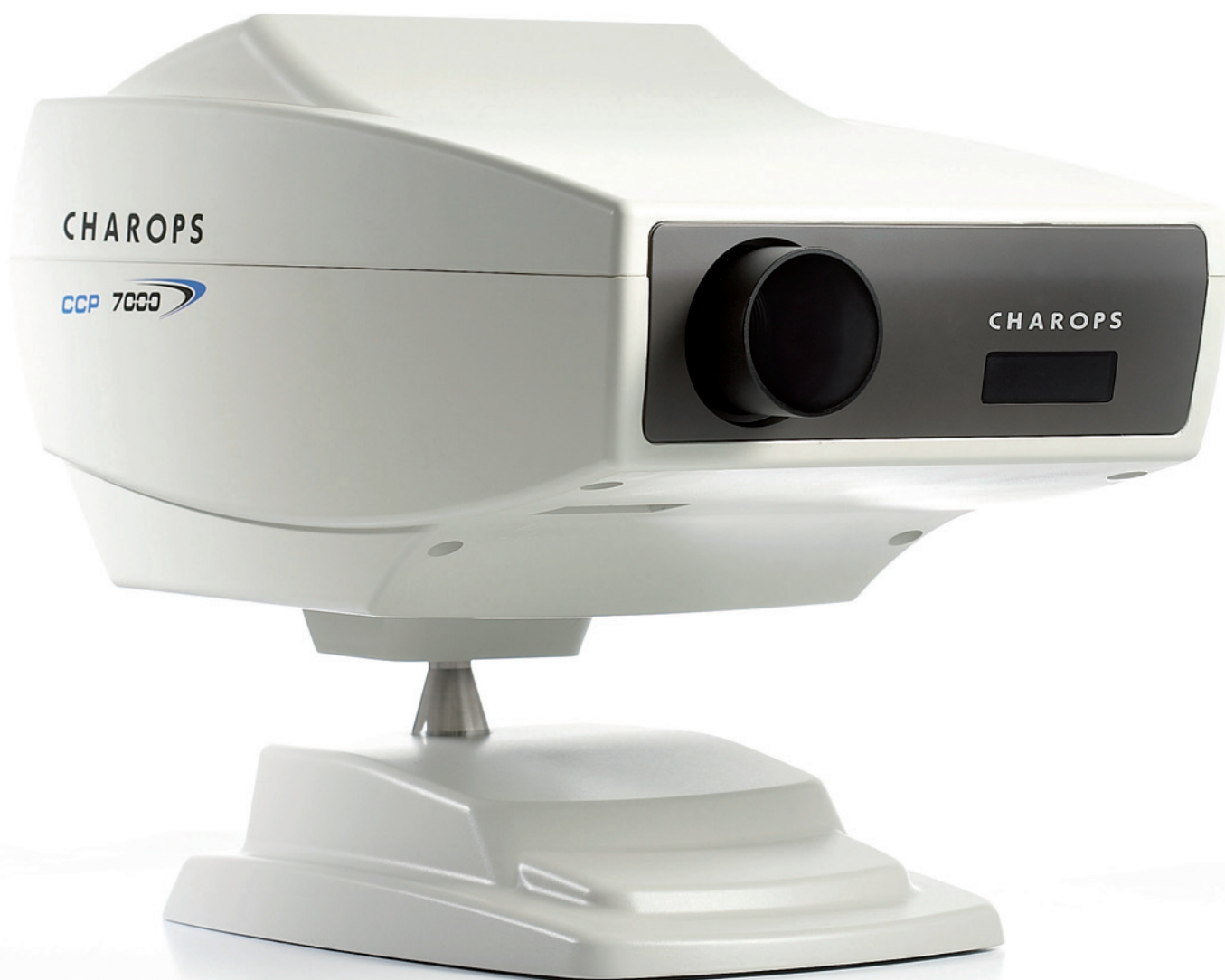
Chart Projector CCP-7000