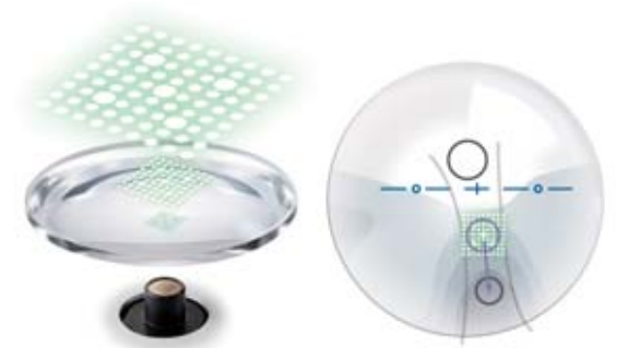
Hartmann Sensor / Green Light Beam(540nm)

Implementation of Hartmann Sensor Wavefront Analysis Technology with more measuring spots maximizes accuracy in measurement even for multi-focal and high curved lenses.